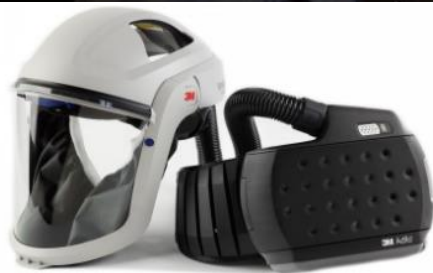
3M™ Versaflo™ Face Shield M-107 with 3M™ Adflo™ PAPR

In early 2017, welding fume was reclassified from IARC classification Group 2B (Possibly carcinogenic to humans) to Group 1 (Carcinogenic to humans). This change was primarily associated with the effects of UV exposure on the skin and eyes and also for lung cancers and limited evidence for kidney cancer from welding fume exposures.