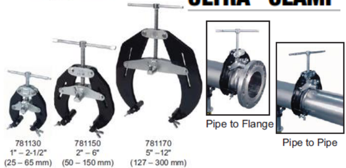
781130 1" – 2-1/2" (25 – 65 mm) 781150 2" – 6" (50 – 150 mm) 781170 5" – 12" (127 – 300 mm)